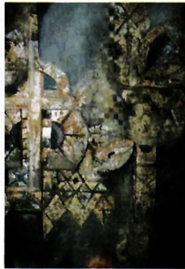
Warsa " Ceremony " Cat Minyak 70 Cm X 100 Cm