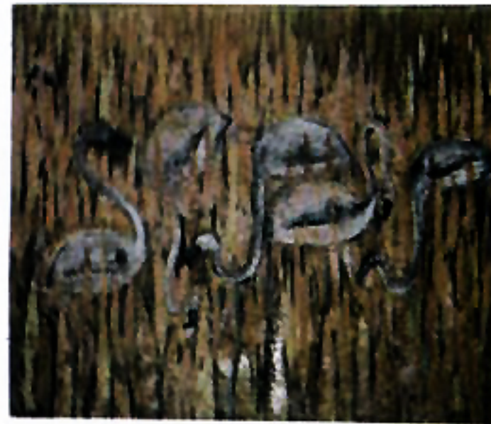
Ds. Ekowati " Flamingo " Cat Minyak 80 Cm X 90 Cm