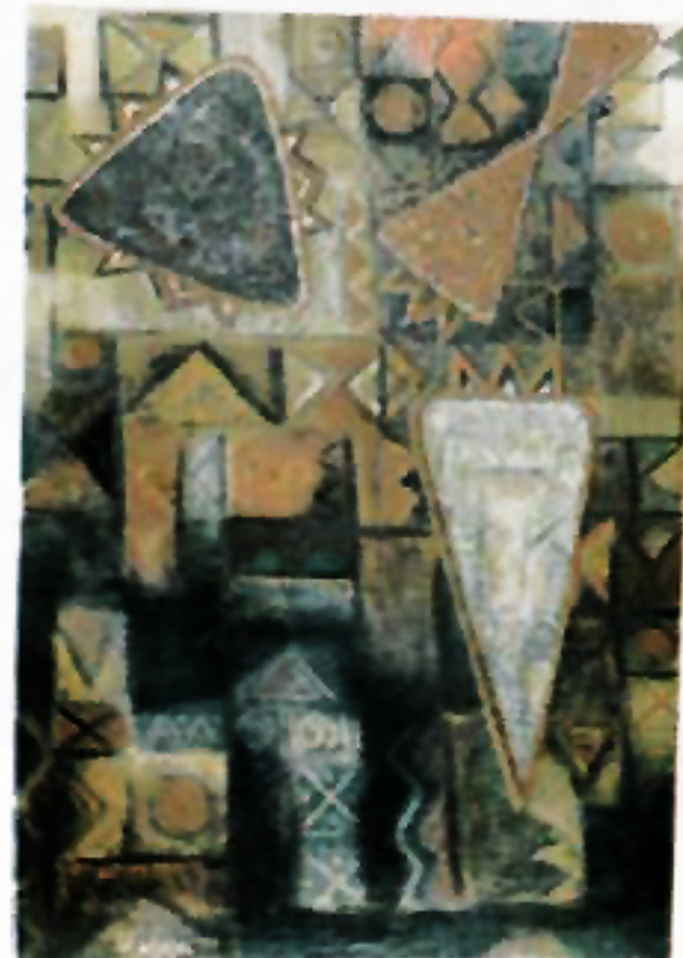
Mahawijaya " Tiga Senjata " Cat Minyak 70 Cm X 90 Cm