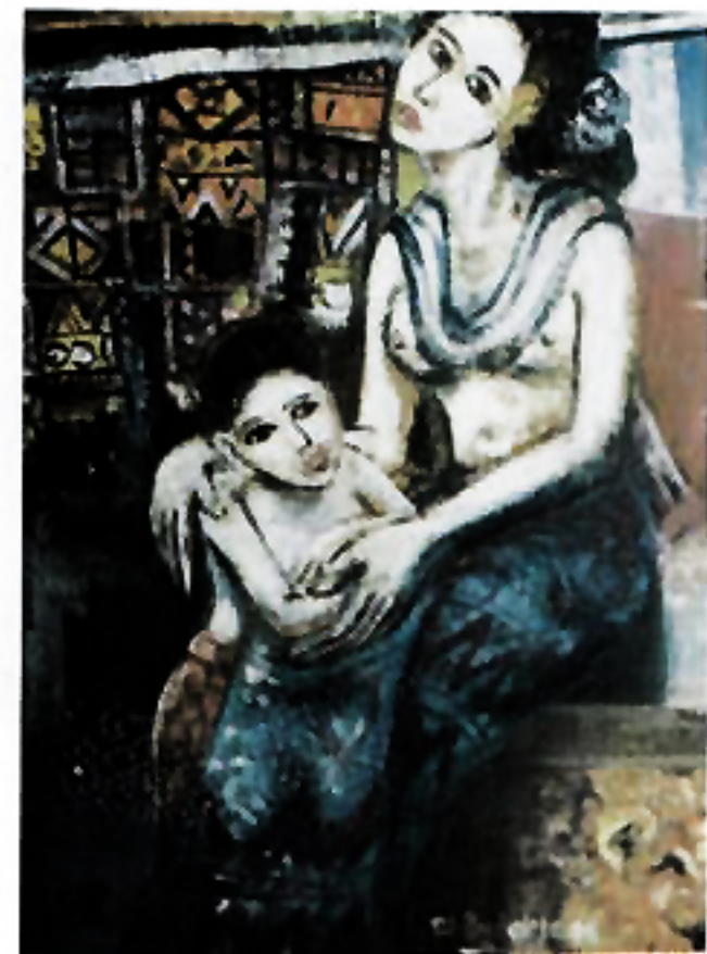
Budarta " Kasih Ibu " Cat Minyak 70 Cm X 90 Cm