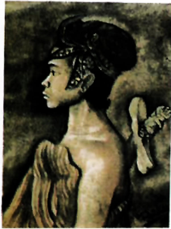
Rekantara " PATIH " Cat Minyak 40 Cm X 64 Cm