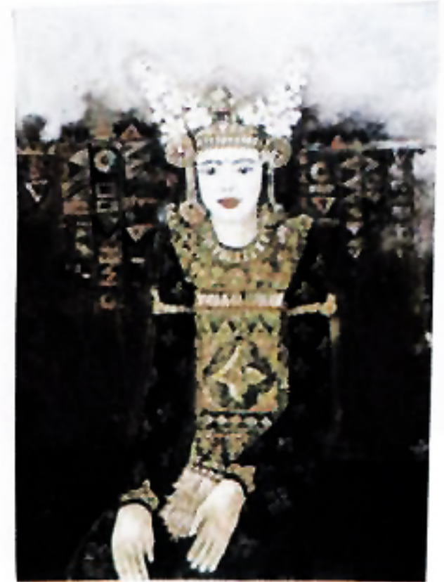
Wirya, S. " Legong " Cat Minyak 80 Cm X 100 Cm