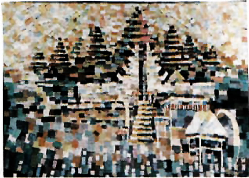
Hendra " Besakih " Cat Minyak 70 Cm X 100 Cm