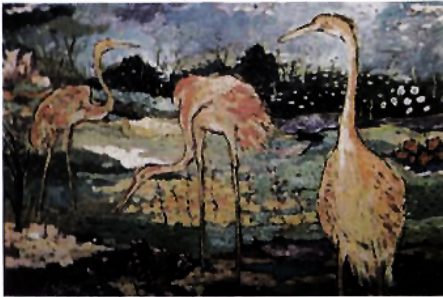
TRESNA " Kokokan " Cat Minyak 70 Cm X 80 Cm