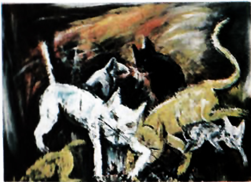
Widiarta " Kucing " Cat Minyak 100 Cm X 120 Cm