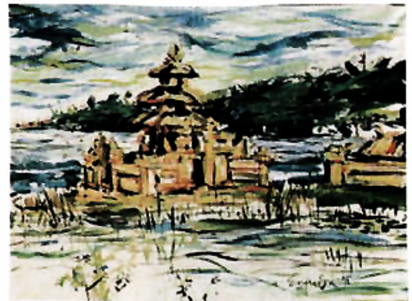
Endrawan " Bedugul " Acrilic 60 Cm X 75 Cm