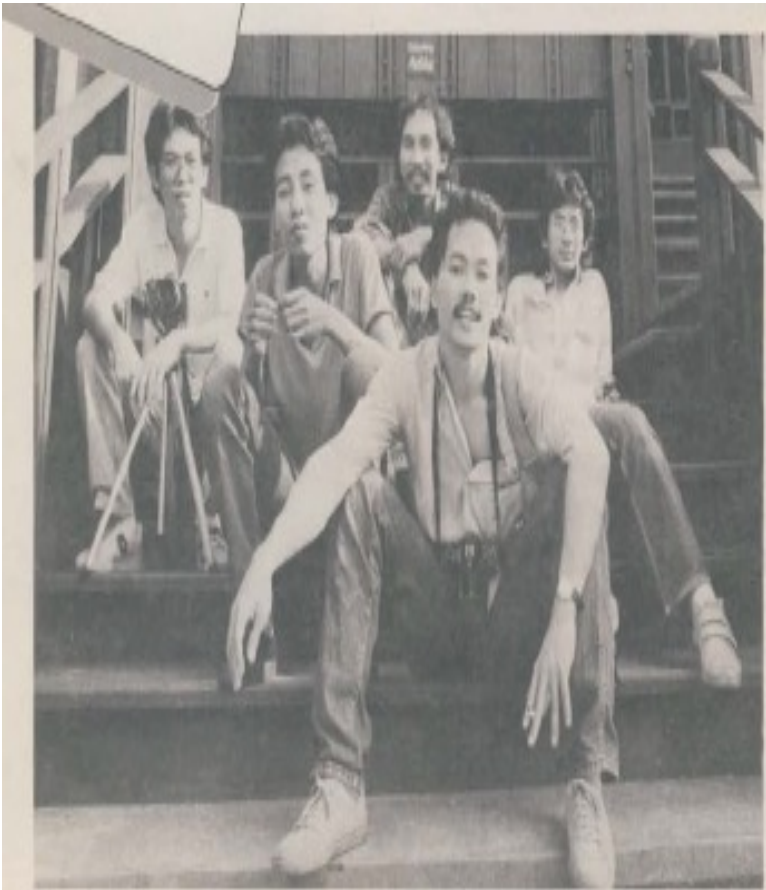
The Process '85 gang

Informal fine art education in Yogyakarta is certainly interesting to consider, not least because these educational bodies are not too strict about their teachings, and often even seem to be a bit hotch potch. Clearly they are social groups, formed through coinciding perspectives on life, interests and concepts about fine art.