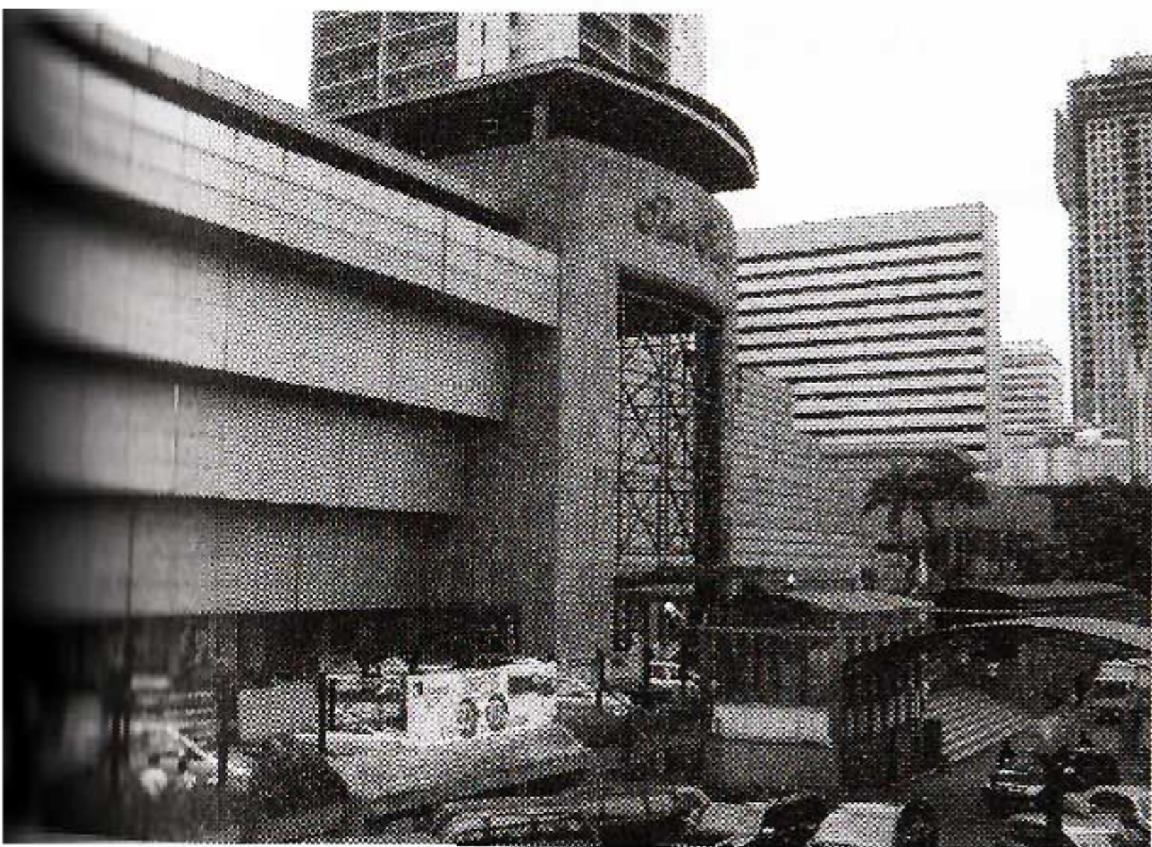
04 Ratu Plaza Office Tower 19 th floor

Jl. Jend. Sudirman Kav. 9 Jakarta Pusat Buka 10.00 – 17.00