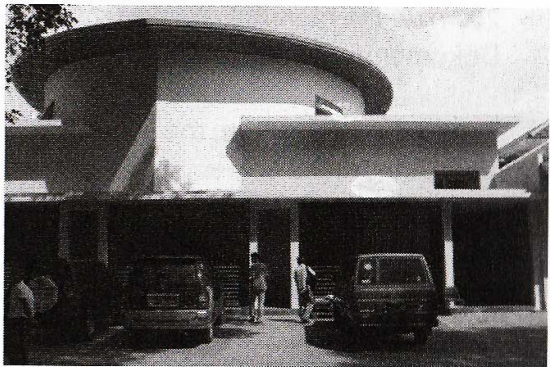
B 02 GoetheHaus

Jl. Jend. Sudirman Kav. 9 Jakarta Pusat Buka 10.00 – 17.00